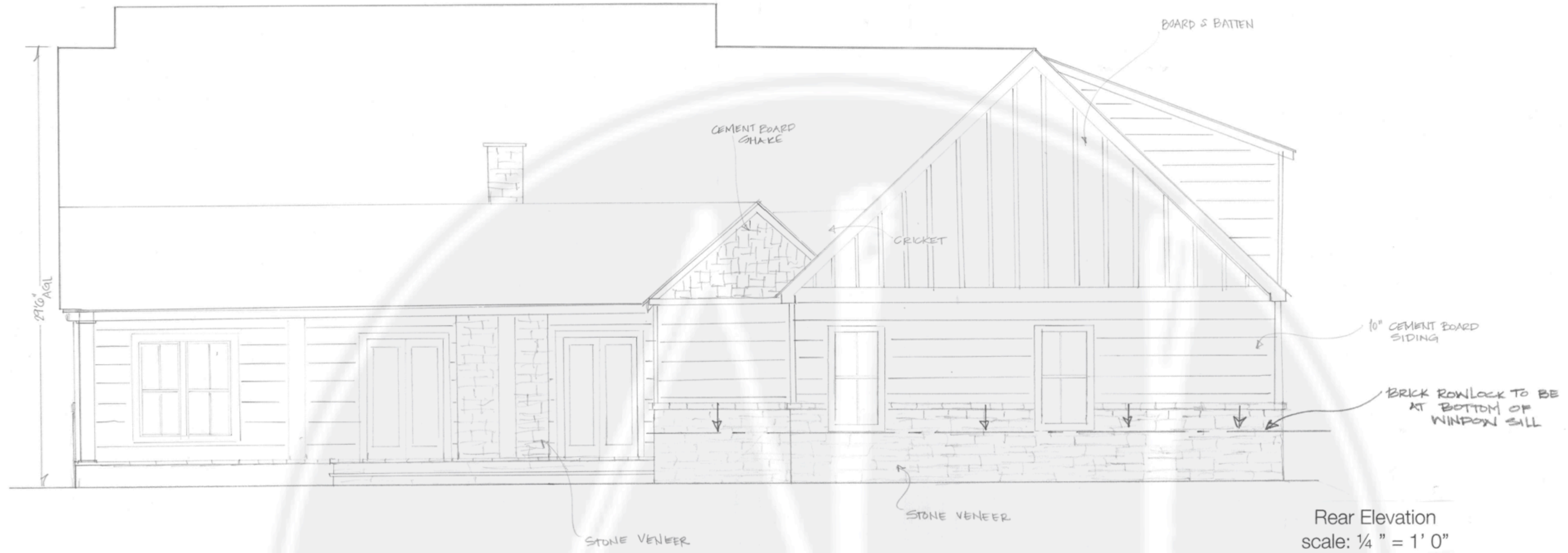
Rear Elevation scale: 1/4" = 1' 0"