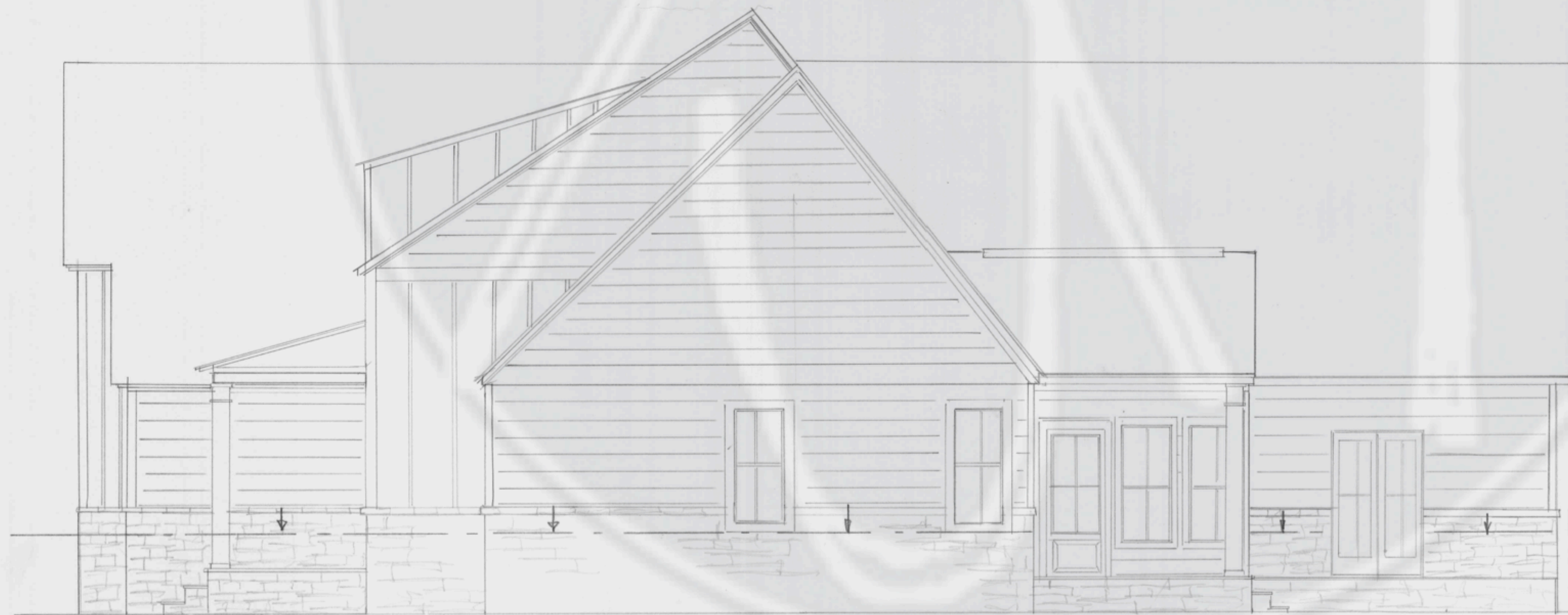
Right Side Elevation Scale: 1/4" = 1'0"