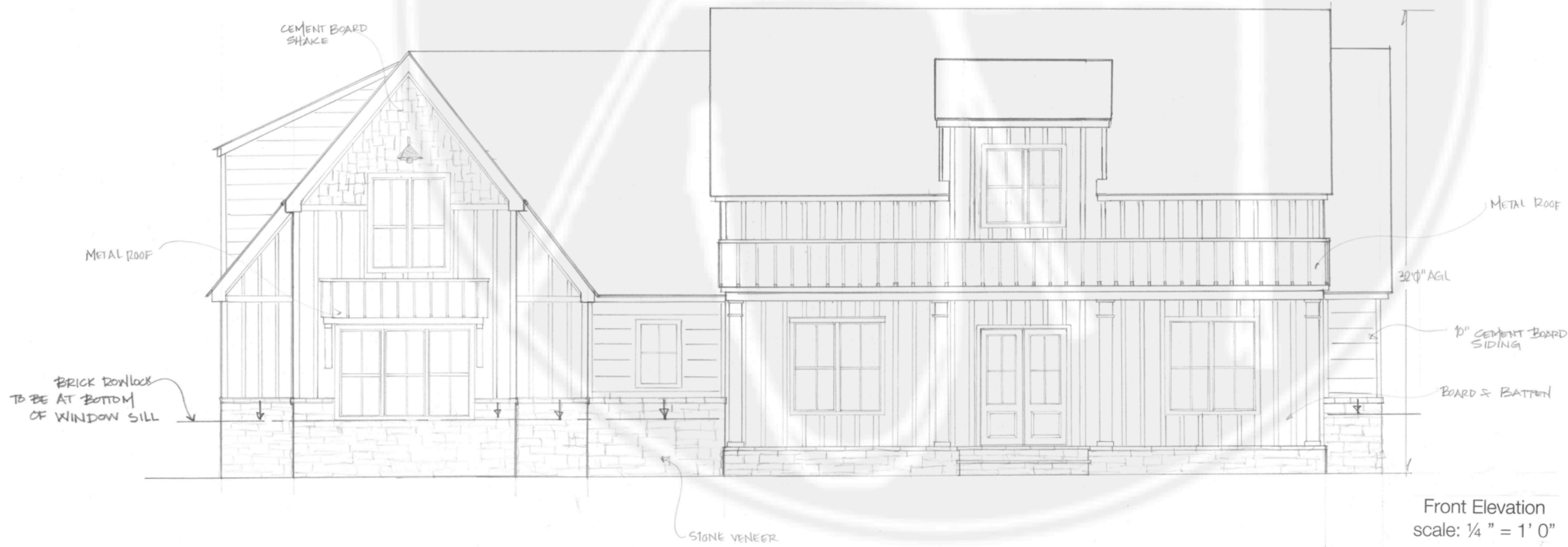
Front Elevation scale: 1/4" = 1' 0"