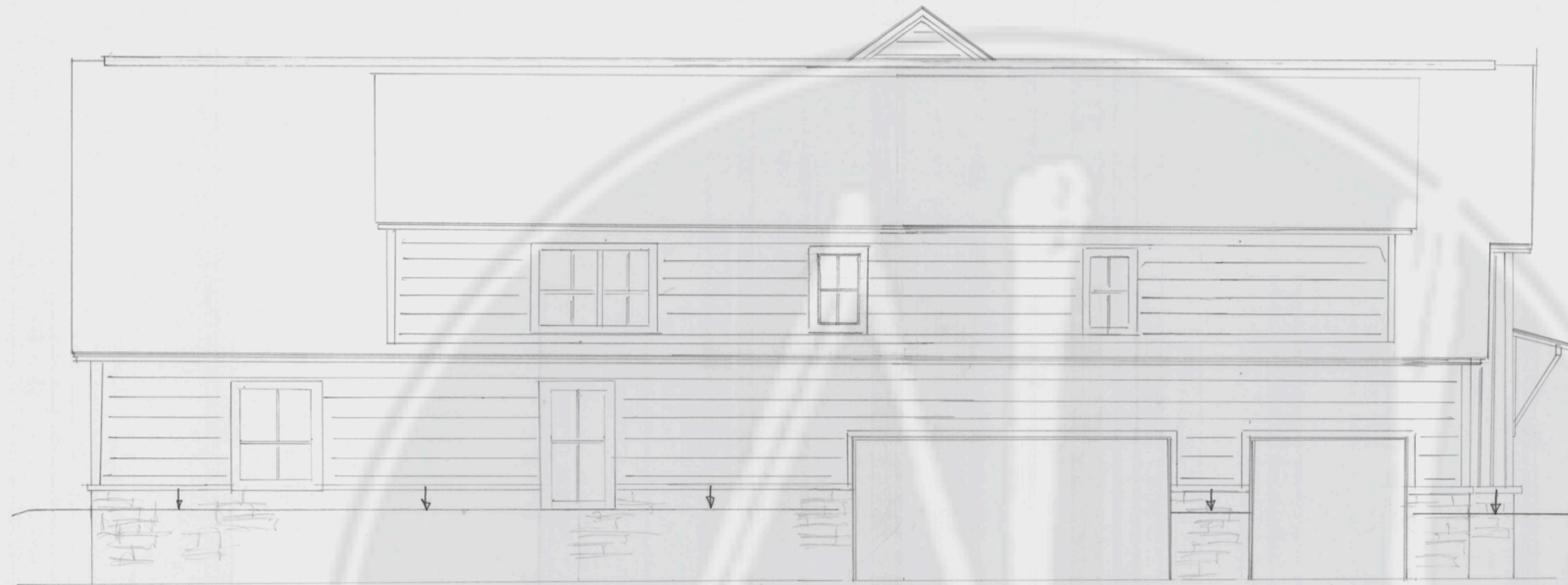
Left Side Elevation Scale: 1/4" = 1'0"