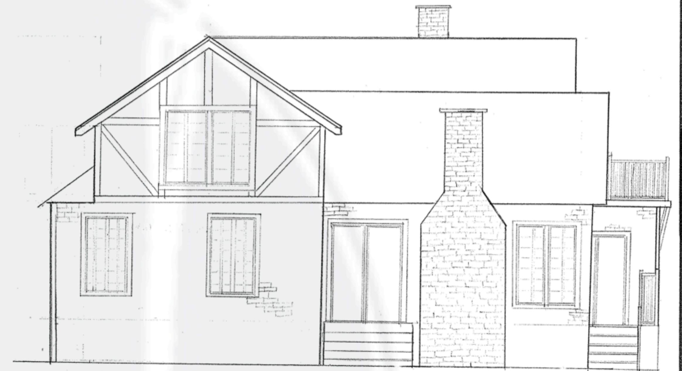
Rear Elevation Scale: 1/4" = 1'0"