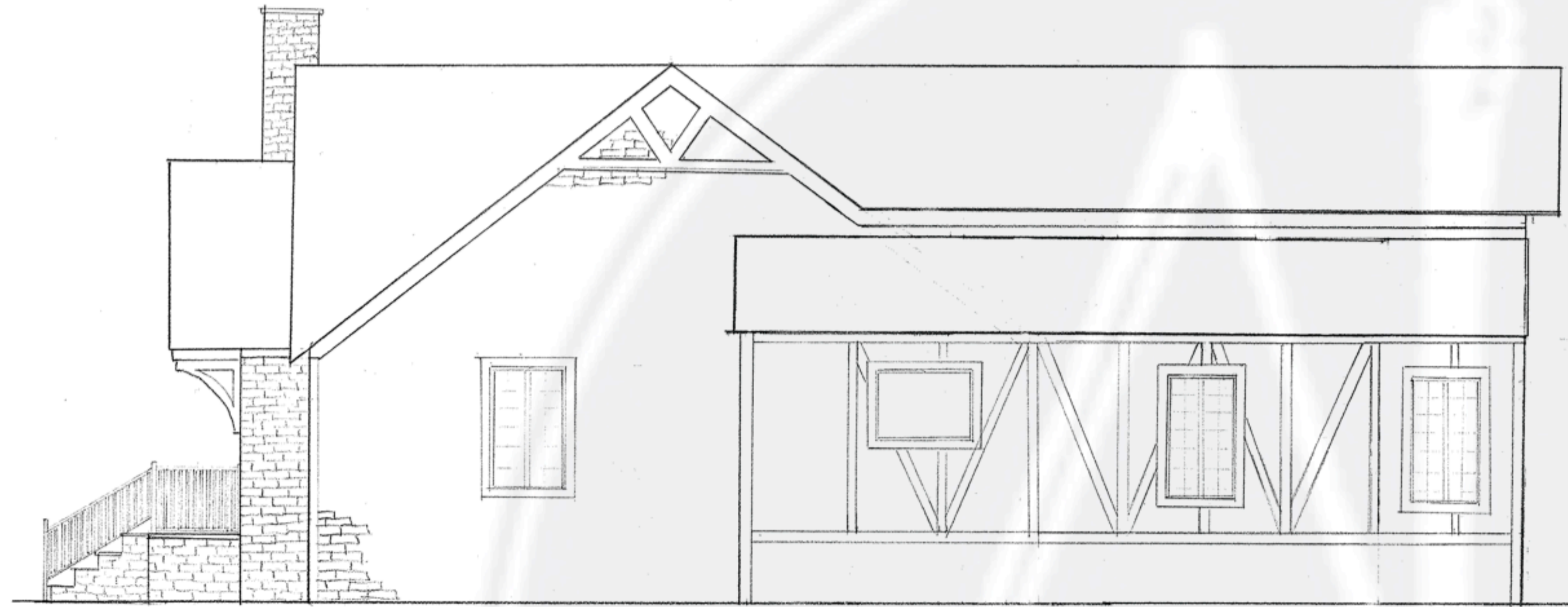
Right Side Elevation Scale: 1/4" = 1'0"