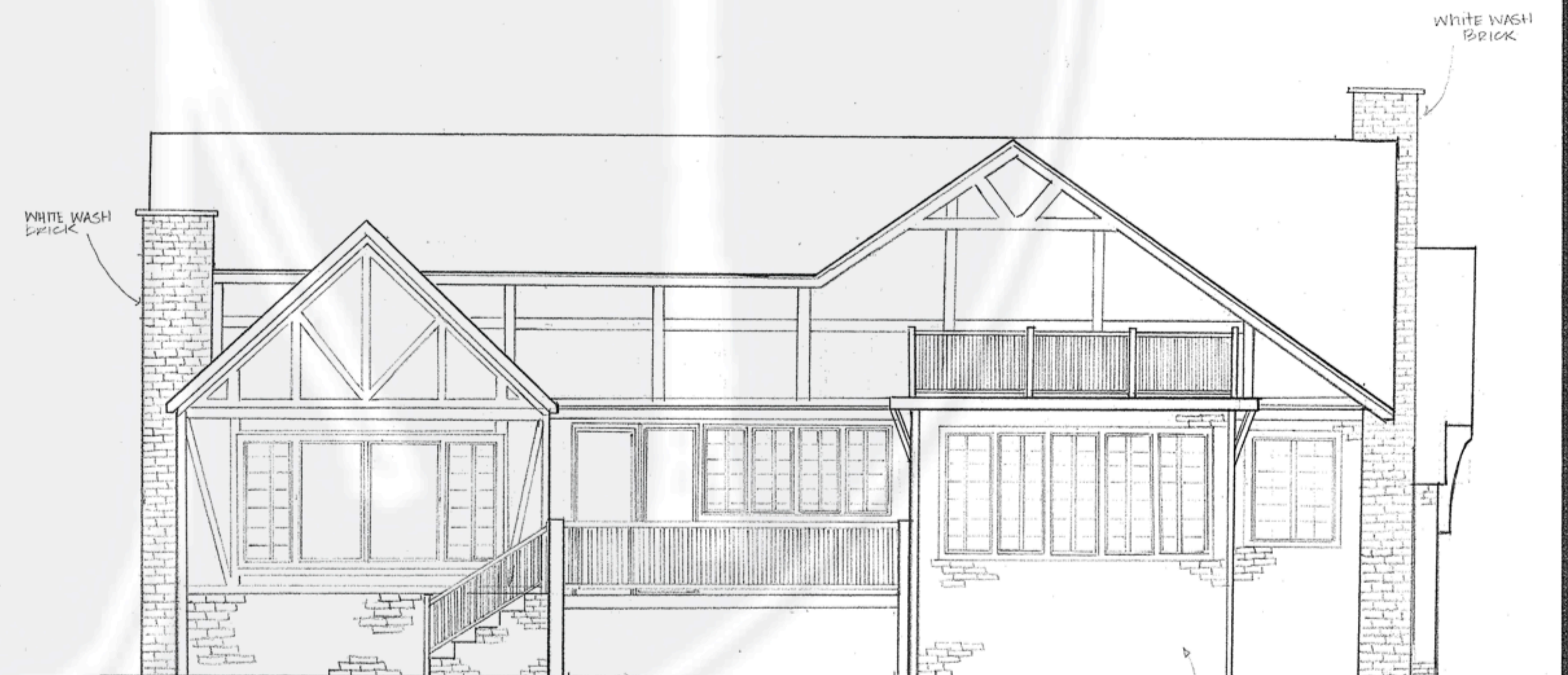
Left Side Elevation Scale: 1/4" = 1'0"