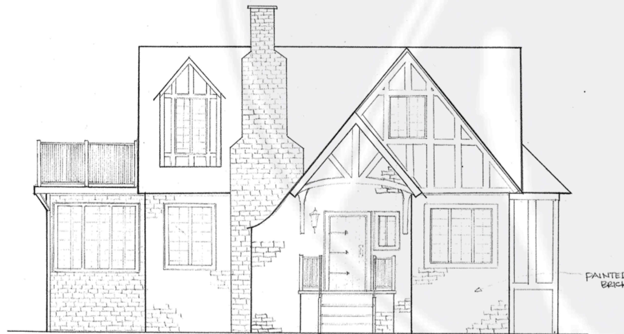
Front Elevation Scale: 1/4" = 1'0"